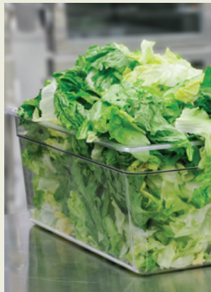
Greens after a Hobart salad dryer spin: Fresh & Fluffy