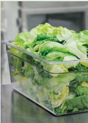
Greens before a Hobart salad dryer spin: Wet & Soggy